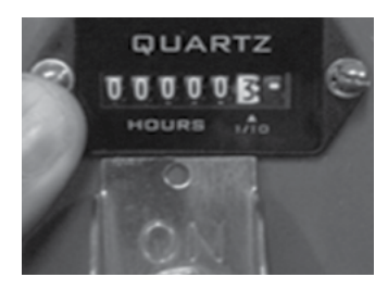
Run Hour Meter Option

Dimensions: 12 1/8'' wide x 25'' long x 15'' high (41.5'' high with air intake installed).