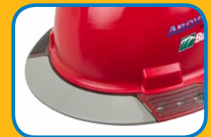
Grey Tint for shade