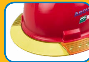
Yellow Tint to prevent glare