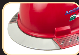
Clear Tint for full visibility

Use Part Numbers listed above and add CS to the end of the Part Number