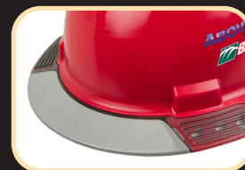
Grey Tint for shade