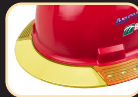
Yellow Tint to prevent glare

Bullard Center 2421 Fortune Drive Lexington, KY 40509 • USA 877-BULLARD (285-5273) Tel: +1-859-234-6616 Fax: +1-859-246-0243