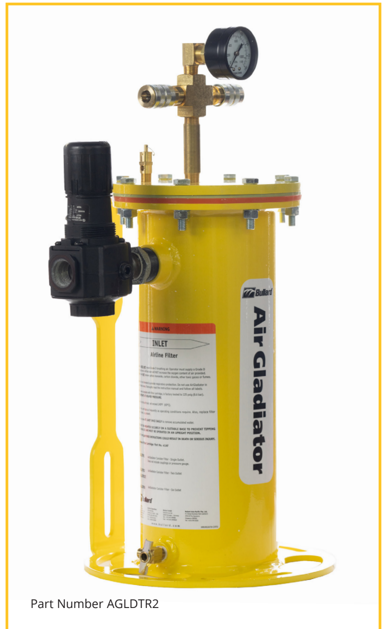
Part Number AGLDTR2