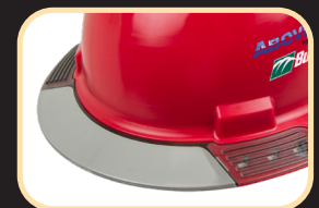
Grey Tint for shade