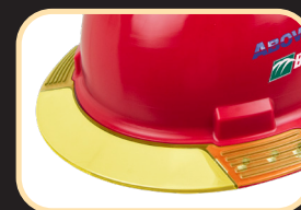
Yellow Tint to prevent glare

Bullard Center 2421 Fortune Drive Lexington, KY 40509 • USA 877-BULLARD (285-5273) Tel: +1-859-234-6616 Fax: +1-859-246-0243