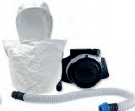
EVA System RT