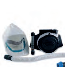
EVA System LF